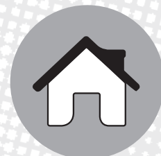
Nine months' rent