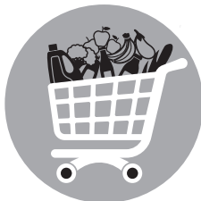
Groceries for the family