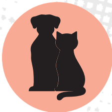
Looking after your pets