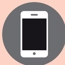
A tablet or smartphone