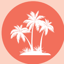
A relaxing holiday