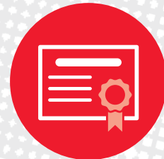
Enrol in a course