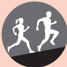
Gym membership for a year